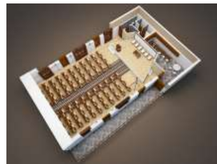
Auditorium top view

international web conferencing and live interactions with eminent scholars and scientists a reality for our students and researchers. This is a transition period for UCC, with new challenges and enduring promises.