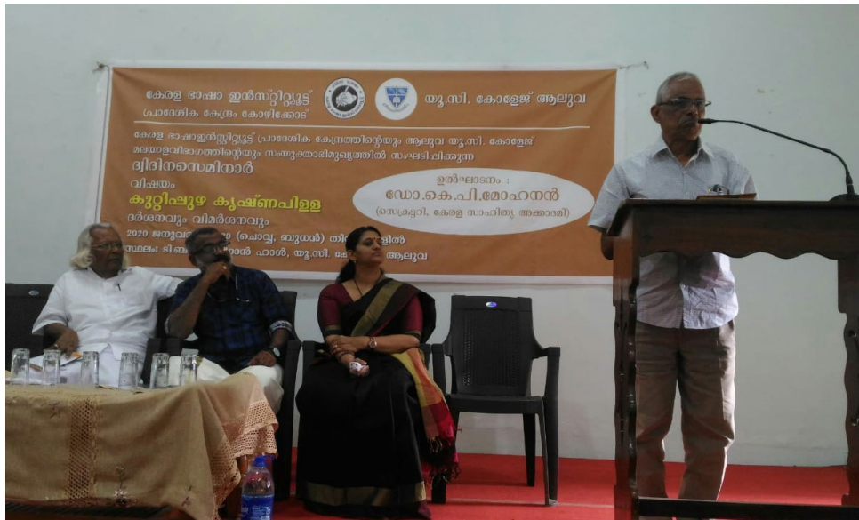
Two days National Seminar on Kuttippuzha Darsanavum Vimarshanavum